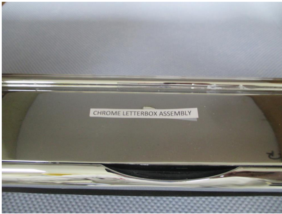
Photograph showing the condition of the Chrome Letterbox Assembly after 96 hours Salt Spray Test