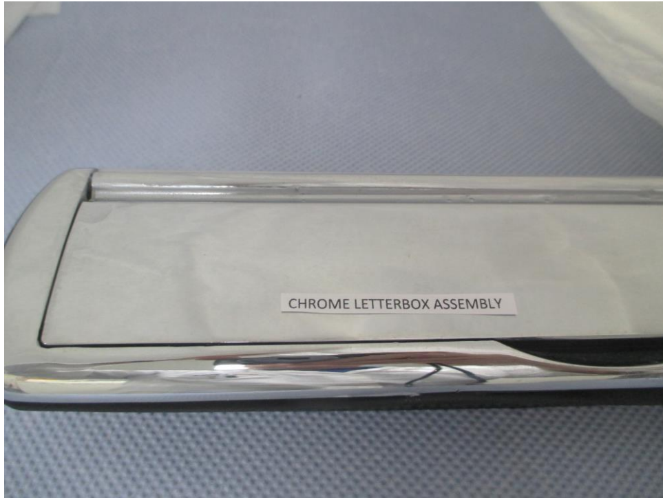
Photograph showing the condition of the Chrome Letterbox Assembly after 264 hours Salt Spray Test