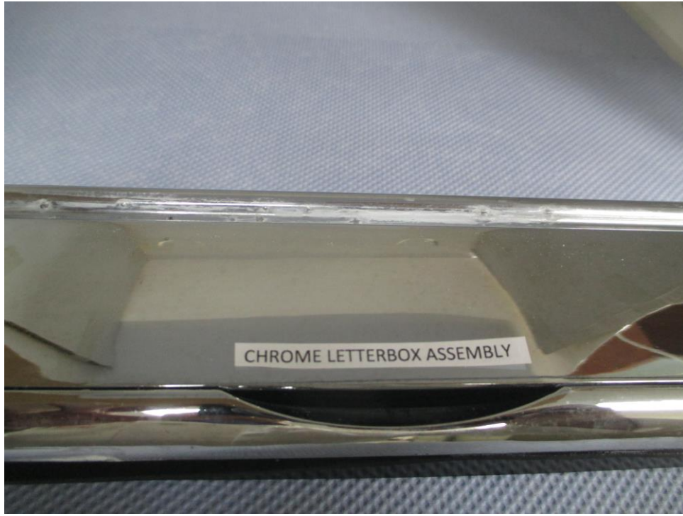
Photograph showing the condition of the Chrome Letterbox Assembly after 480 hours Salt Spray Test