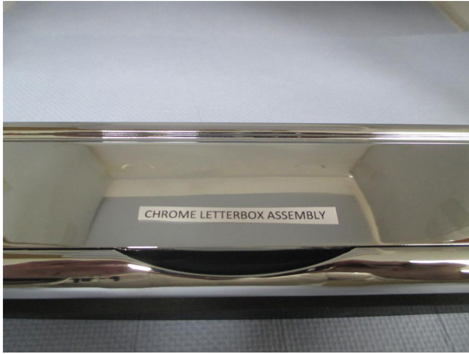
Photograph showing the condition of the Chrome Letterbox Assembly prior to Salt Spray Test