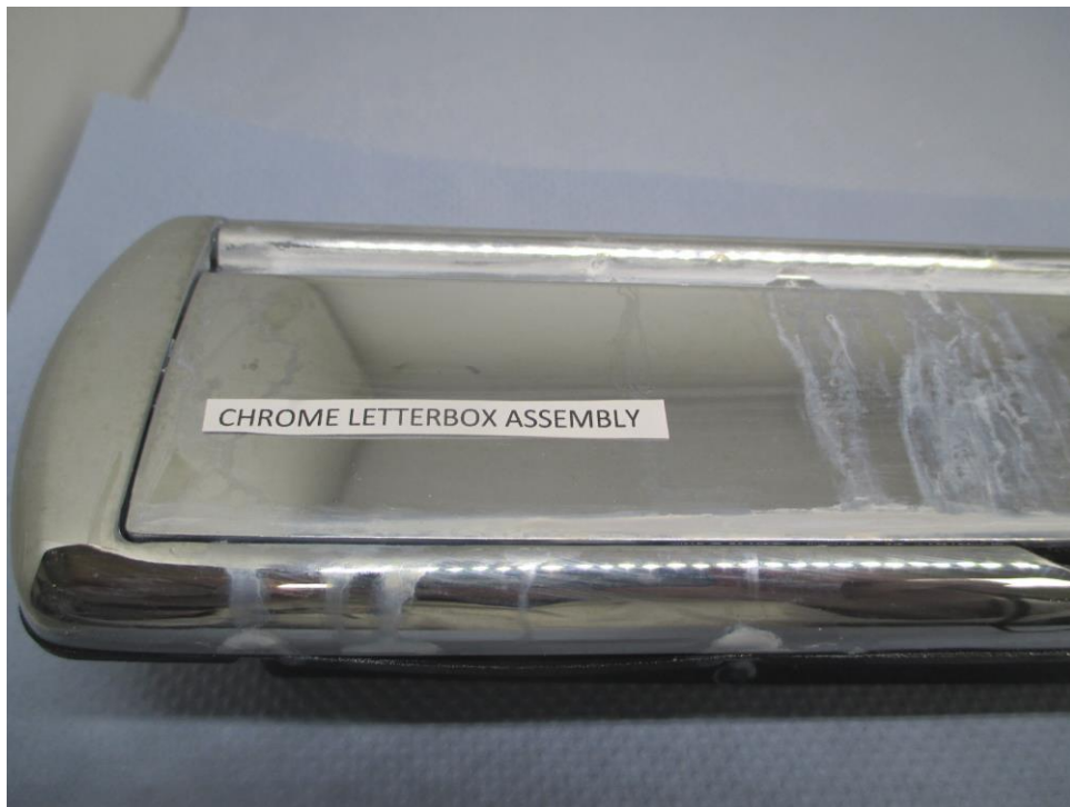
Photograph showing the condition of the Chrome Letterbox Assembly after 1008 hours Salt Spray Test