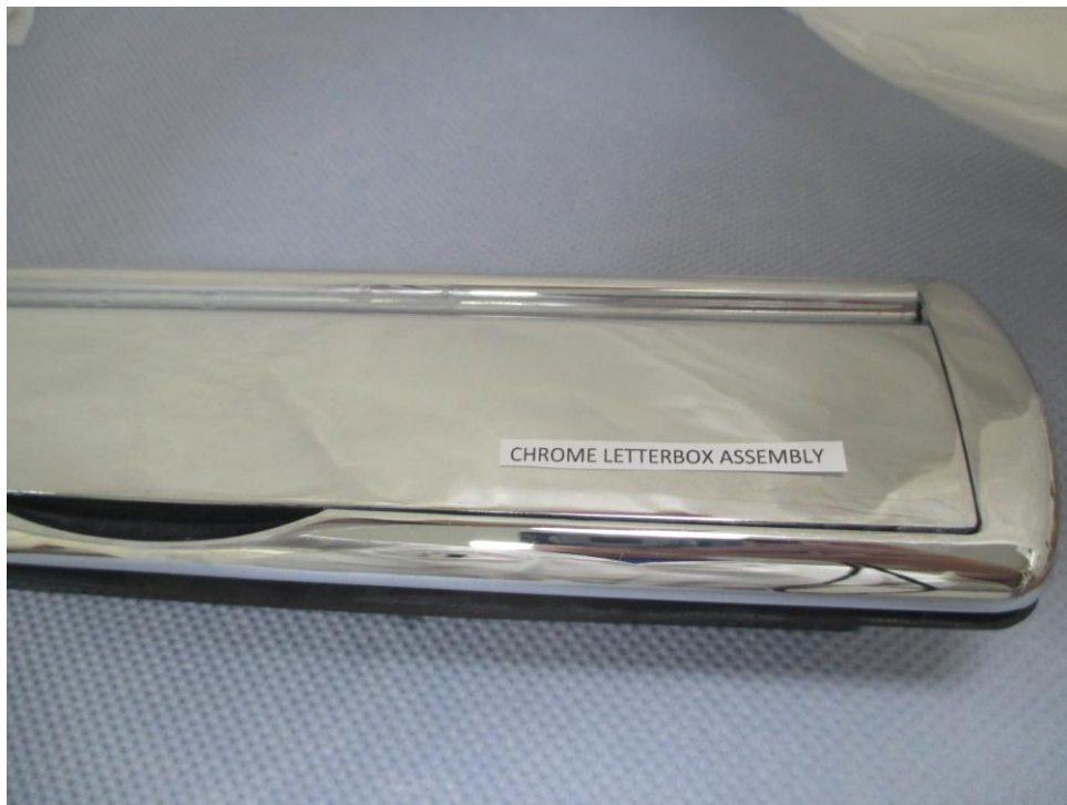
Photograph showing the condition of the Chrome Letterbox Assembly after 264 hours Salt Spray Test